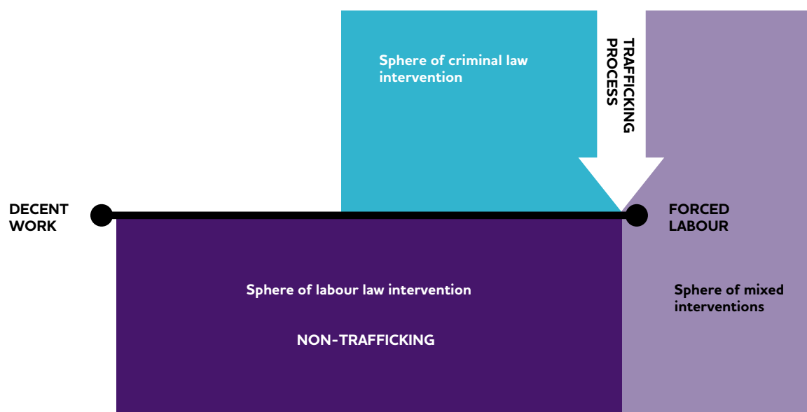
Figure 1: Continuum of exploitation and interventions

Forced labour and human trafficking are not the same, although they sometimes overlap. For this reason, they should be dealt with separately in policy and in practice. Human trafficking is a process of bringing someone into a situation of exploitation. It is a series of connected actions with the final purpose being a form of exploitation (such as labour or sexual exploitation). The whole process is exploitative, although this is not always evident, especially at the initial stages. The overlap occurs where labour exploitation is the intended purpose of human trafficking. In summary, human trafficking is a sub-set of forced labour – it is not a synonym.